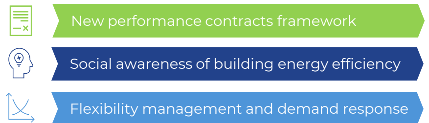
Figure 4: Key impacts

As the project is in its final stages, EBENTO's impacts on modernising the planning, financing and managing renovation projects can already be identified (Figure 4).